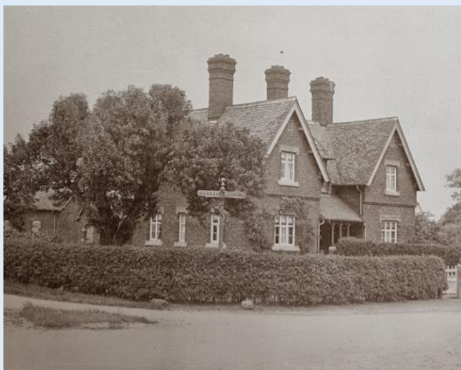
Four Lane Ends 1917