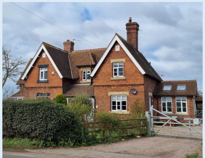
Four Lane Ends 2023