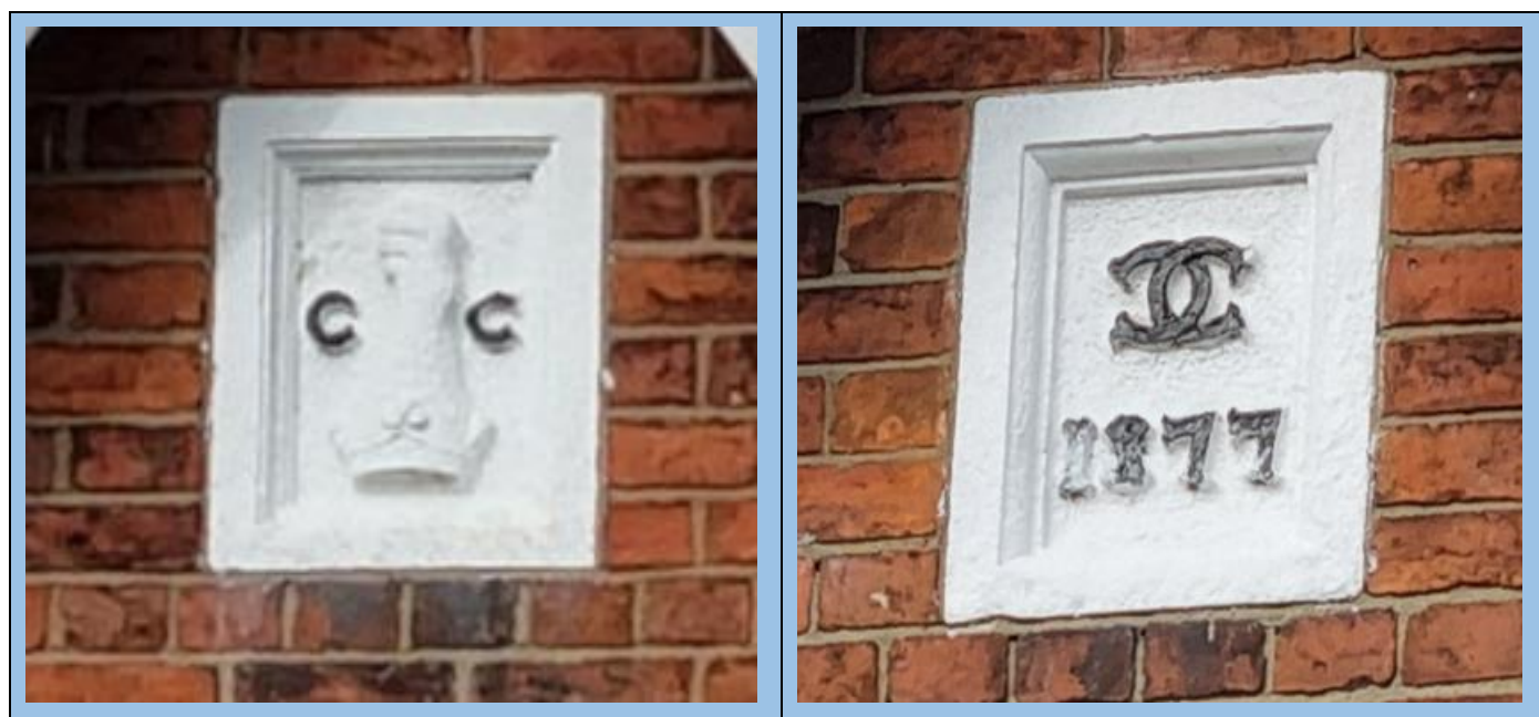
Crewe Estate Annual Rental & Accounts 1878-79 Elton. CRO Ref 59/5/114