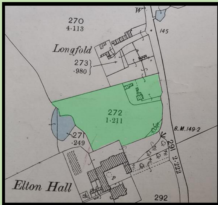
OS Map 1898