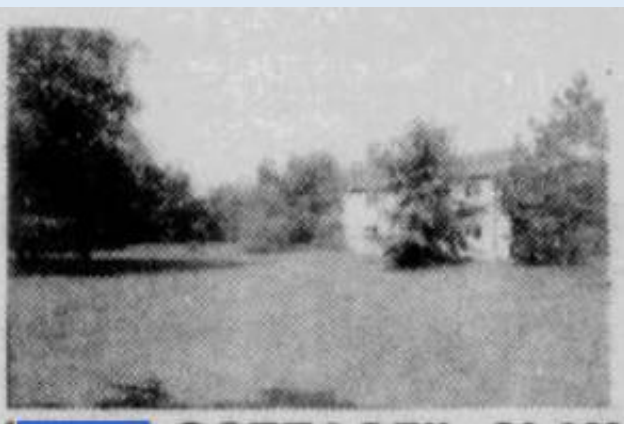
Pine Cottage 1987