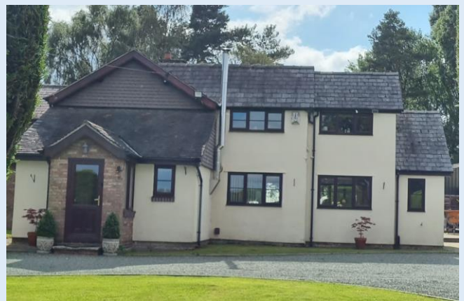
Pine Cottage 2023